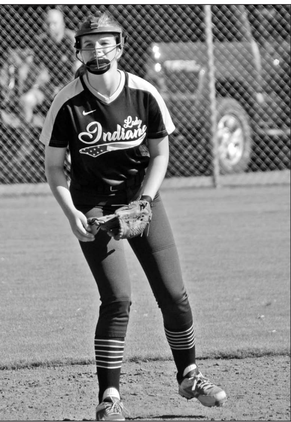
The Towns County Lady Indians fell 9-0 last Tuesday in a Region 8-A contest at Lake Oconee Academy in Greensboro. On Thursday, Towns County traveled to Rabun County for a non-region contest against the Lady Cats. Unfortunately, Towns came out on the wrong end of a 10-0 shutout. The Lady Indians continue their non-region stretch when they host Cedar Shoals on Tuesday. First pitch vs. the Lady Jaguars is scheduled for 5 p.m.